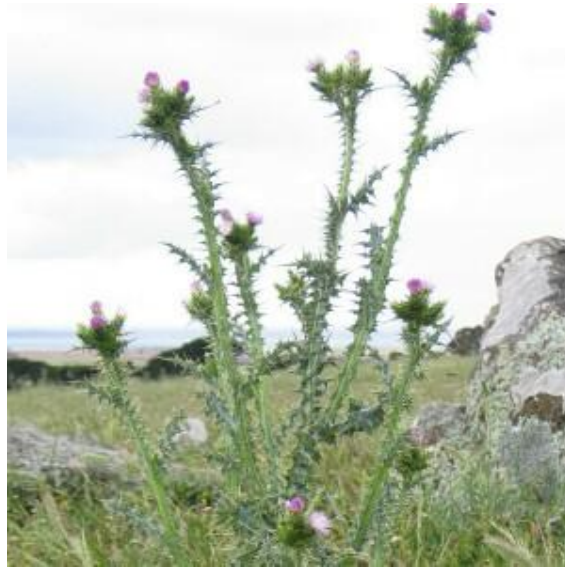
Variegated Thistle ( Silybum marianum )