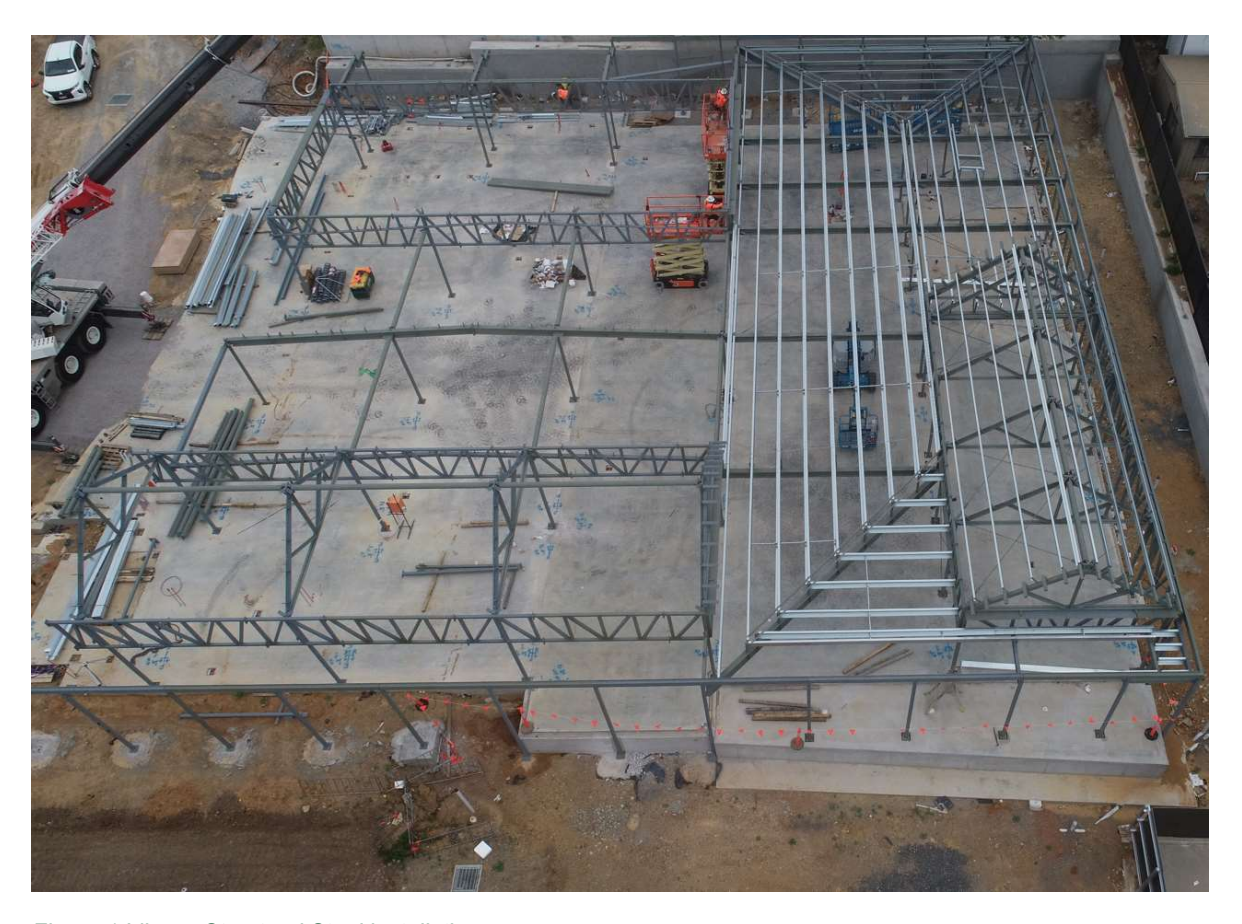
Figure 1 Library Structural Steel installation