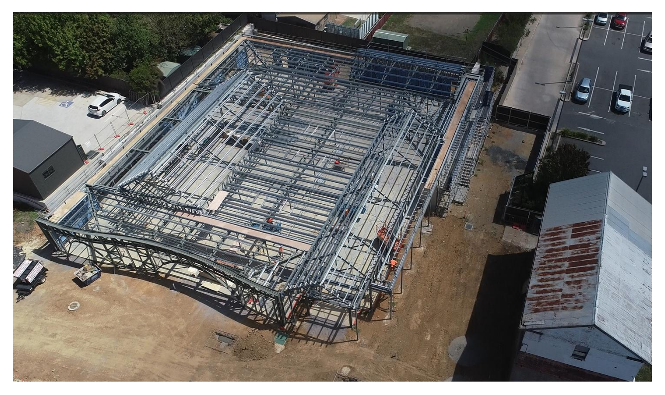
Figure 1 Library Structural Steel Works